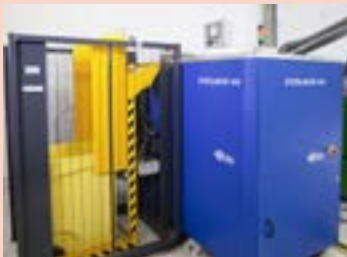
Sterilwave 440 capacity up to 88kg/h*

Sterilwave® range of solutions: adapted to any size of healthcare facilities