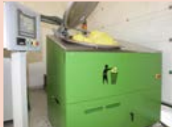
Sterilwave 250 capacity up to 50kg/h*