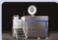
STERILWAVE 440 up to 88kg/h*