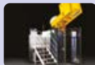
STERILWAVE 900 up to 180kg/h*