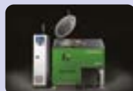
STERILWAVE 250 up to 50kg/h*