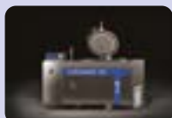
STERILWAVE 100 up to 20kg/h*