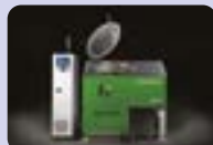
STERILWAVE 250 up to 50kg/h*