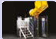
STERILWAVE 900 up to 180kg/h*