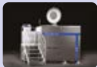
STERILWAVE 440 up to 88kg/h*