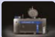
STERILWAVE 100 up to 20kg/h*