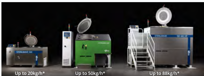
Up to 20kg/h*